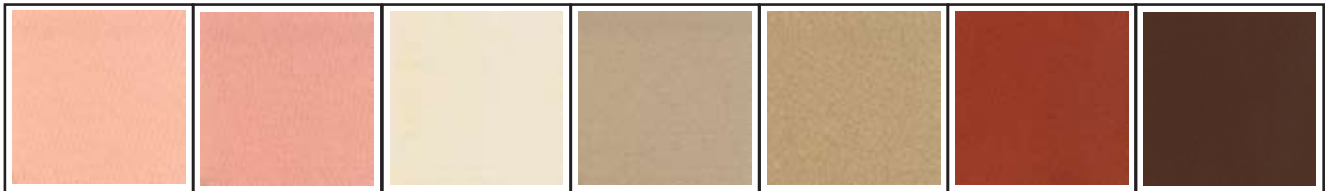
Peach PMS# 162u Carnation PMS# 487c Bone PMS# 7506u Beige PMS# 7502u Sable PMS# 466u Terra Cotta PMS# 174c Brown PMS# 476c